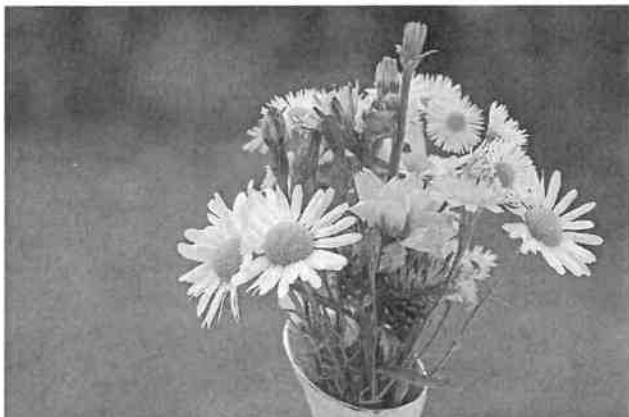
ALTAR FLOWER CHART is located in the narthex. Sign up to "Say it with Flowers."

A feast day marking the Baptism of Jesus has been celebrated in the Church since the second century A.D. It is not only a celebration of the presence of the Holy Spirit, but also has come to be seen as the true beginning of Jesus' ministry on earth. But to make this day more than just the celebration of a moment in history, we need to remind ourselves of the connection which each of us has – through our Baptism – to Jesus himself, and to the whole Body of Christ.