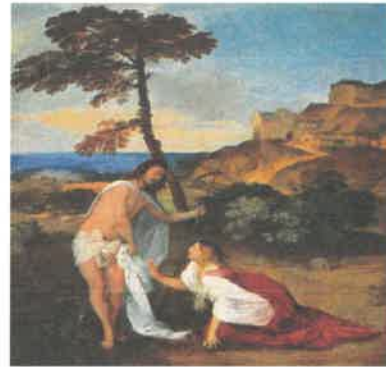
Noli me tangere (c. 1512) by Titian

The gospels report Mary Magdalene as one of the women of Galilee who followed Jesus. She was present at Jesus' crucifixion and his burial. When she went back to the tomb on the first day of the week to anoint Jesus' body, she was the first person to whom the risen Lord appeared. She returned to the disciples with the news and has been called "the apostle to the apostles" for her proclamation of the resurrection. In art, because John's gospel describes Mary as weeping at the tomb, she is often portrayed with red eyes. Some iconographic traditions depict her standing by the tomb and holding a bright red egg, a symbol of the resurrection.