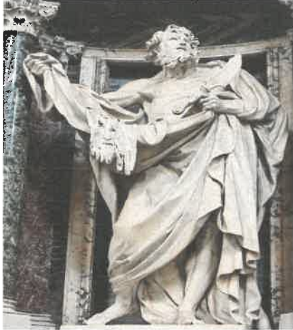
Statue of Bartholomew at the Archbasilica of St. John Lateran in Rome by Pierre Le Gros the Younger